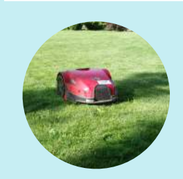
Robots are claiming extra wages for working during Zombie attack